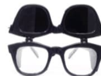
TWO IN ONE