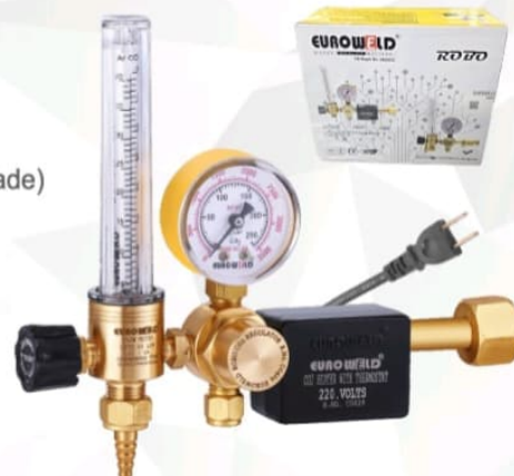
Argon Regulator With Flow Meter