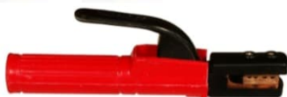
EURO FULLY COPPER